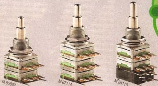
M 85052: Duplo pot (dual axis, 2 resistance levels) M 87114: multifunctional pot (dual axis, 3 resistance levels) M 84110: Duplo Pull/Push pot (dual axis, 2 resistance level, ON/ON, DPDT-switch) Shaft: inside ø 4mm, outside ø 6mm - Bushing: M 10x0,75 mm, 9mm long